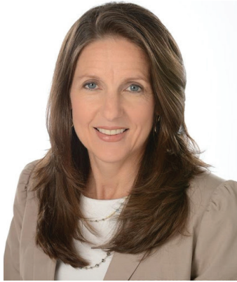
Commissioner Denice DiCarlo

This Women’s History Month, Gloucester County is honored to celebrate Commissioner Denice DiCarlo.